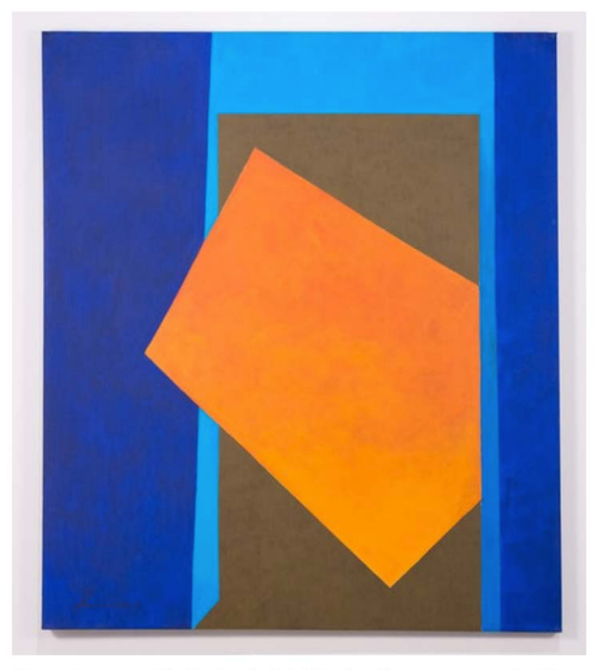
Wassef Boutros-Ghali, Untitled, 2009. Acrylic on canvas, 59 \times 51 inches. Courtesy the artist and albertz benda, New York. Photo: Casey Kelbaugh.

This Le Corbusierian vision of architectural precision may also suggest something else, putting Boutros-Ghali more in the order of those who built the system than those who, when faced with it, took up the brush. Among all the neat channels, clean lines, Boutros-Ghali's end result is sinister: a sort of nostalgia for Egypt's liberal age (1923-1952), for an Arab nation that does not exist, all expressed by a