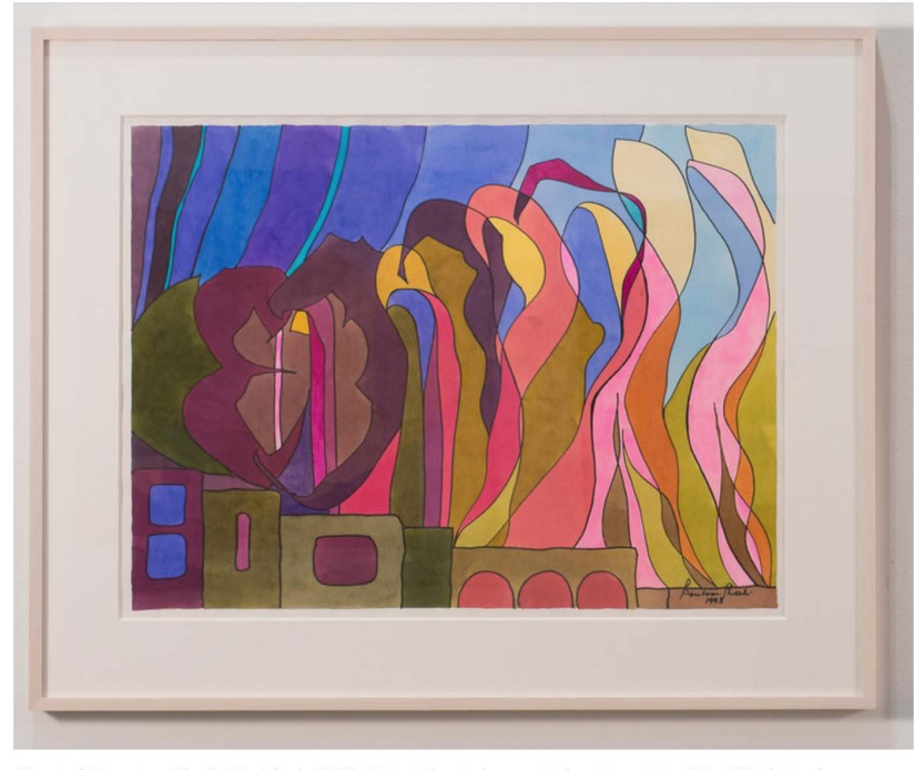
Wassef Boutros-Ghali, Untitled, 1993. Pen, ink, and watercolor on paper, 27 \times 391/4 inches. Courtesy the artist and albertz benda, New York. Photo: Casey Kelbaugh.

November 12 – December 19, 2020 New York