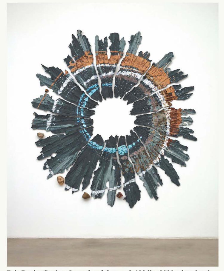
Brie Ruais, Circling Inward and Outward , 128 lbs , 2020, glazed and pigmented stoneware, rocks, hardware, 96 by 92 by 3 inches; at Night.

The pieces shown at Night Gallery—sculptures, photographs, and an installation (all 2020)—derive from road trips to the Western states. Reviewing a Ruais show in Los Angeles in 2014, I wrote that she made "earthworks on the scale of the individual body." Her own weight continues to serve as a metric, while her own knuckles, knees, fingers, and toes remain her tools for shaping spirals, C-curves, and centrifugal patterns. But now the scale and scope of the work have expanded with Ruais's adoption of the Great Basin in Nevada as both source and setting. The shift aligns her ever closer with site-specific, process-oriented, performative precedents of the '60s and '70s by artists as diverse as Michelle Stuart, Judy Chicago, Ana Mendieta, and Richard Long.