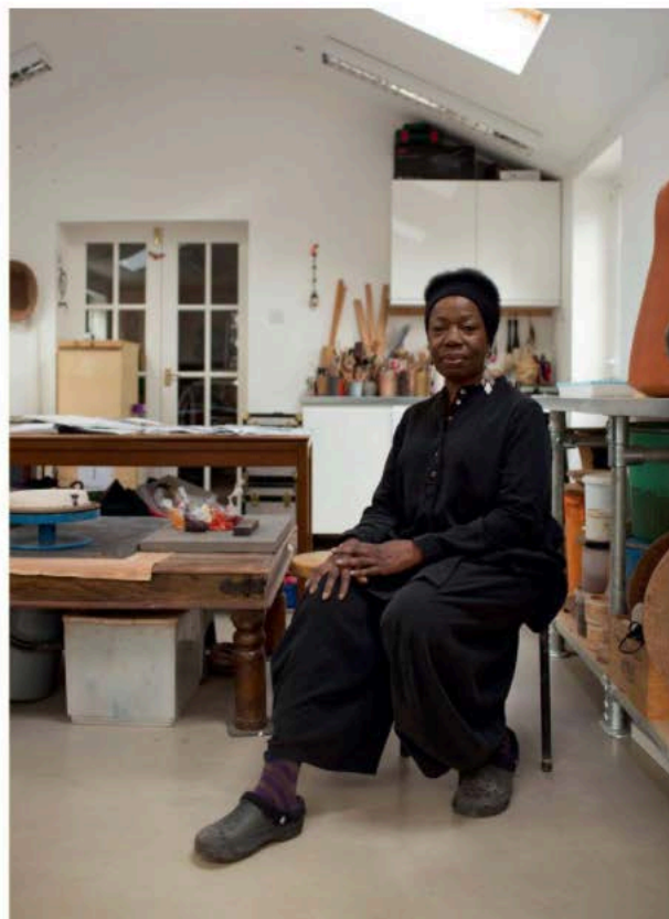
Left: Untitled, 1990, burnished and carbonised terracotta by Magdalene Odundo. Right: The artist in her Surrey studio.