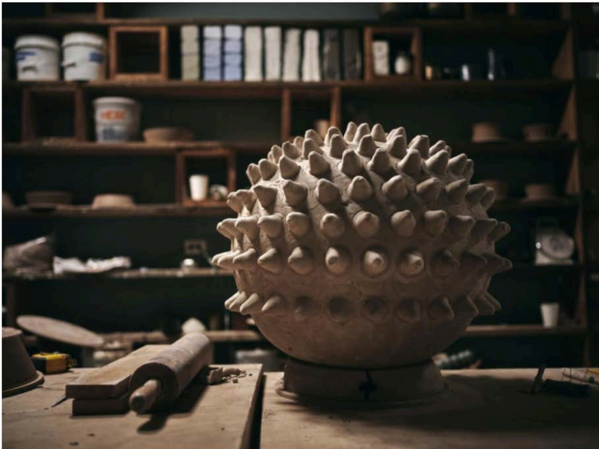
Theaster Gates's Ceramics Studio , Chicago, 2020. © Theaster Gates. Photography: Chris Strong. Courtesy Gagosian

Lloyd Smith, Harriet. "Ceramic artists: top trail-glazers breaking the mould," Wallpaper . 16 Aug 2021.