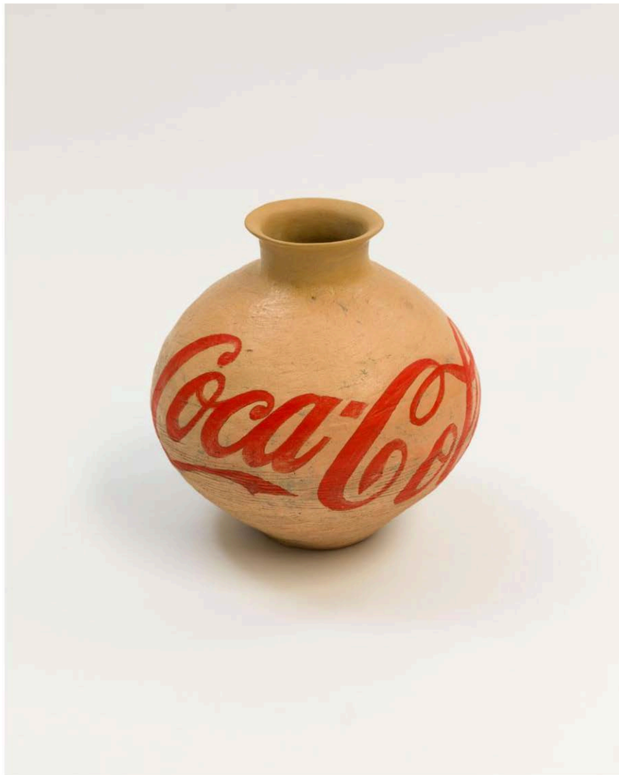
Ai Weiwei, Coca Cola Vase , 2011. Han Dynasty vases (206BC-220AD) and industrial paint.

Lloyd Smith, Harriet. "Ceramic artists: top trail-glazers breaking the mould," Wallpaper . 16 Aug 2021.