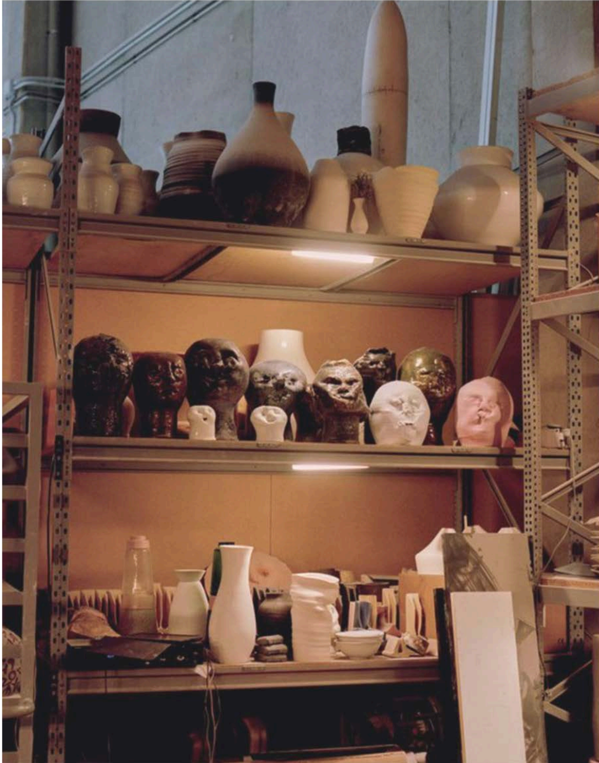
Inside Apparatu's vast ceramics studio in Rubi, Spain. Pictured: finished pieces from the CAP sculpture series. As featured in the April 2019 issue of Wallpaper*.