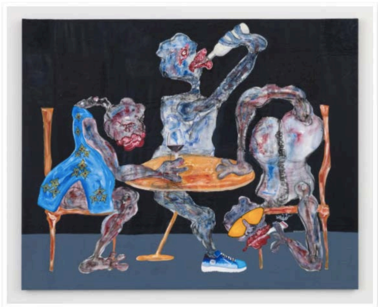
Famakan Magassa - Soif D'addiction, 2021. Acrylic, oil pastel, paper towel on canvas 46 1/2 x 57 5/8 inches, 118 x 146.5 cm. Signed and dated recto Inv# AB13140

We had a chat with Magassa on the occasion of his current show. In an exclusive Widewalls interview, the artist talks about his recent body of work and much more.