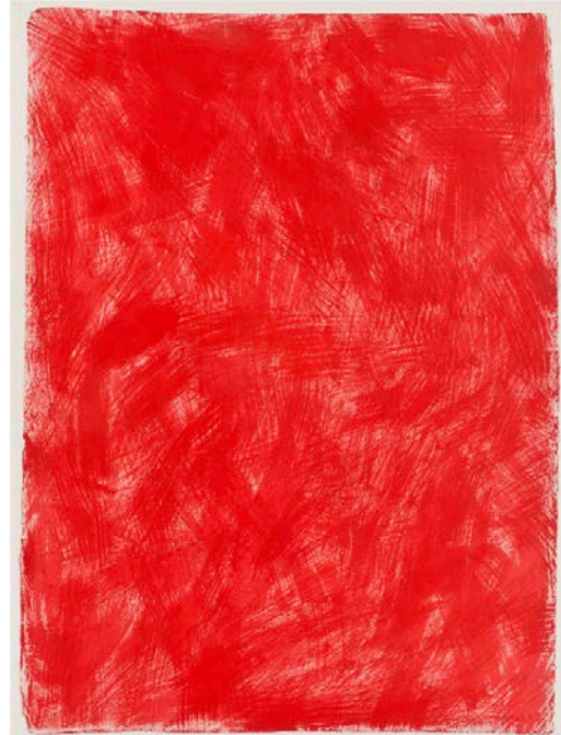
Ed Moses. Exercise in Density #1, 1975-76. Watercolour on paper, 31 x 22 in (78.7 x 56 cm).