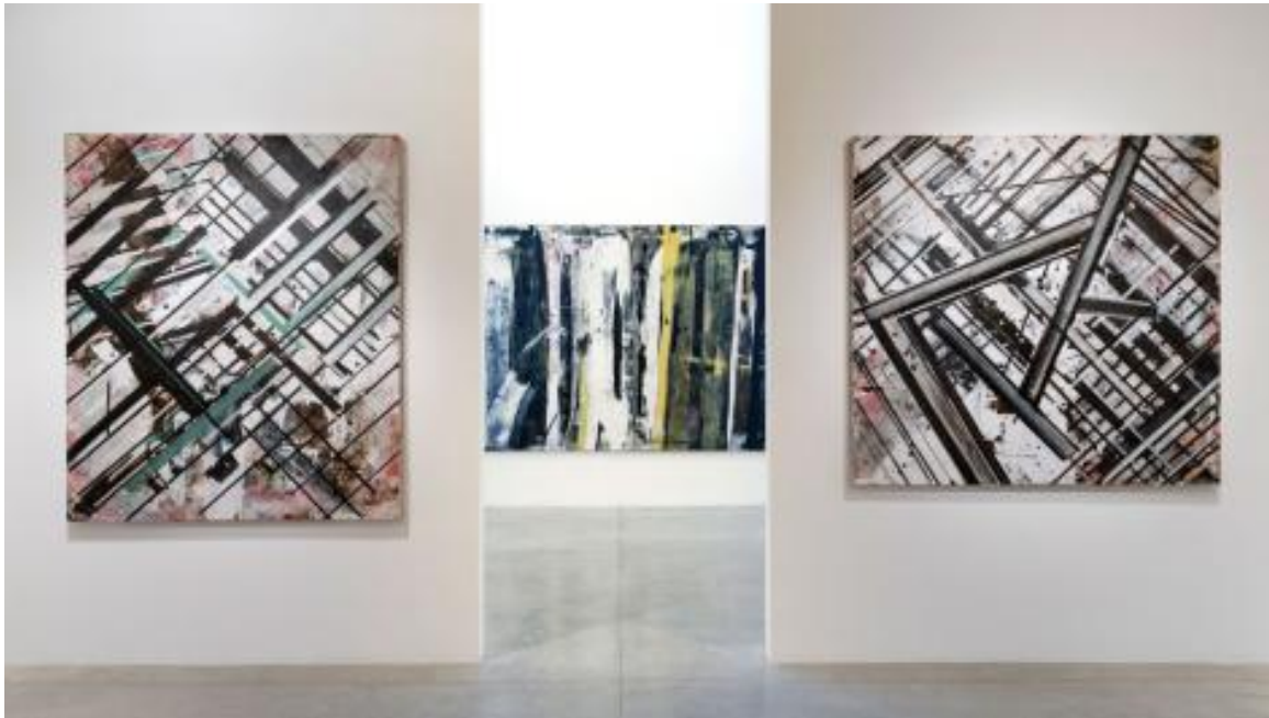
Ed Moses: Painting as Process , installation view. Albertz Benda, New York, NY, September 8 - October 15, 2016.

In the still eye of the swirl of the happening art that opens Manhattan's autumn season stands a small, beautiful and defining exhibition that makes a case for process as mantra, manifesto and trophy