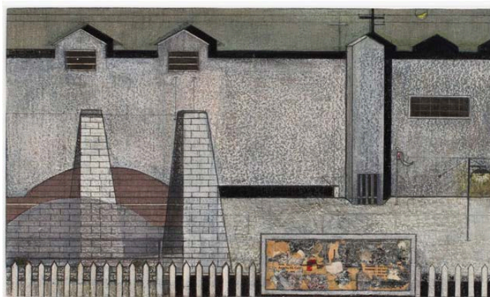
Ed Moses. Gladly McBean, 1953. Crayon, graphite, collage and casein on heavy watercolour paper, 12 x 20 1/4 in (30.5 x 51.4 cm).