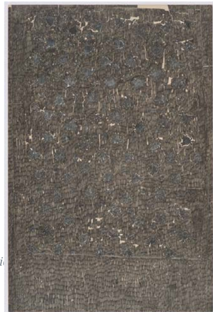
Ed Moses. Rose #6, 1963. Graphite and acrylic on chip board, 60 x 40 in (152.4 x 101.6 cm).

tossed in with that 60s indulgence of impulsive spontaneity that he still waves like a banner. Apart from one steadfast rule (no halogen lighting – it destroys the drama, the romance), “it’s all sort of arbitrary and intermittent”. Moses might choose one colour for everything, or mix up a new palette. If scratches or imperfections remain, he waves them off as part of the process and therefore “part of me”. His crackled paintings came out of the happy accident of