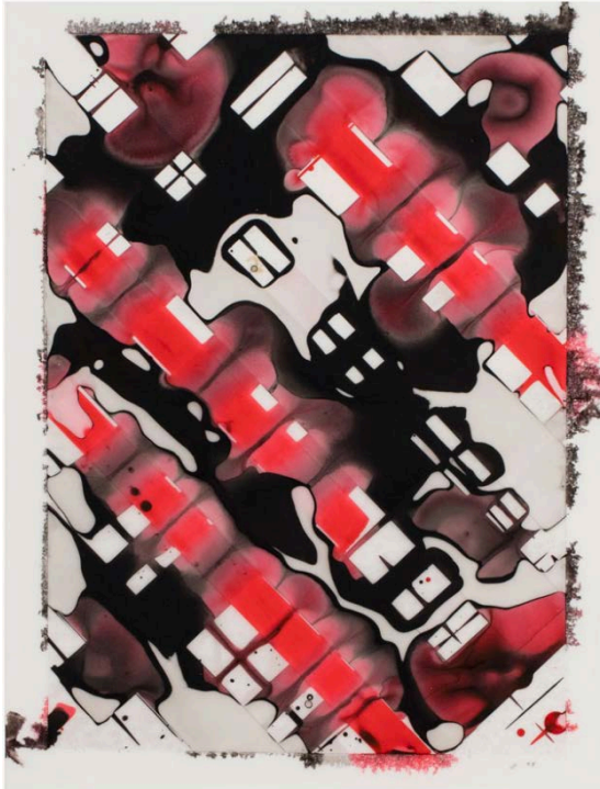
Ed Moses. Glow #10, 1998. Acrylic on mylar, 28 5/8 x 23 1/4 in (72.7 x 59 cm) (framed).

innuendo, overtly sexual imagery that he floated into allusion. He flirted with sponge-painting, snap-line painting, erasure. Periodically, like a dybbuk, the grid returned; sometimes diagonal, sometimes blurred, and always crisscrossed in a vertigo-inducing ambiguity of interlocked planes. The process moved to craquelure, the effect achieved through that famous accident, now recaptured by