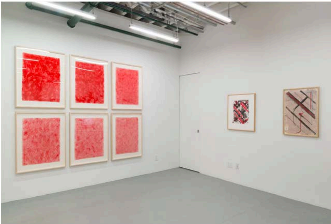
Ed Moses: Painting as Process, installation view. Albertz Benda, New York, NY, September 8 - October 15, 2016.

museums are presenting material targeted to draw front-page reviews; our public spaces are sprouting sculpture of architectural dimensions and, building from Thursday night openings so choked that the mega-galleries are inching forward to Wednesdays, West Chelsea has converted to the world's largest art fair. With 100 galleries and counting offering top wares, and only a 6-8pm time slot to cruise all of them on opening nights, viewer participation relies heavily on word of mouth.