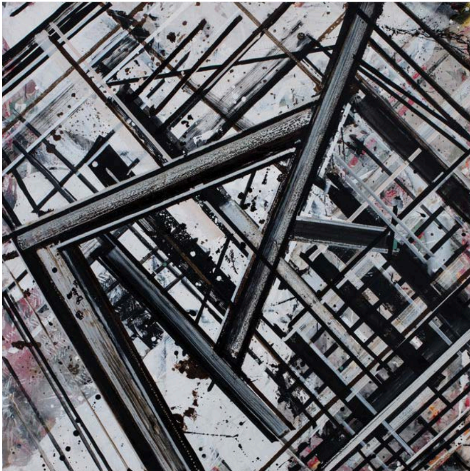
Ed Moses. Rojo de Walden aka Too Structur, 1979. Acrylic on canvas, 60 x 60 in (152.4 x 152.4 cm).

And so, for the most part, it goes, this jagged, jarring, jugular cacophony that is drowning out the basso continuo of lasting and meaningful work. That a 90-year old artist (why am I even mentioning his age?) can override the clamour with the primary tools of canvas and paint is a joy and a solace of a very high order.