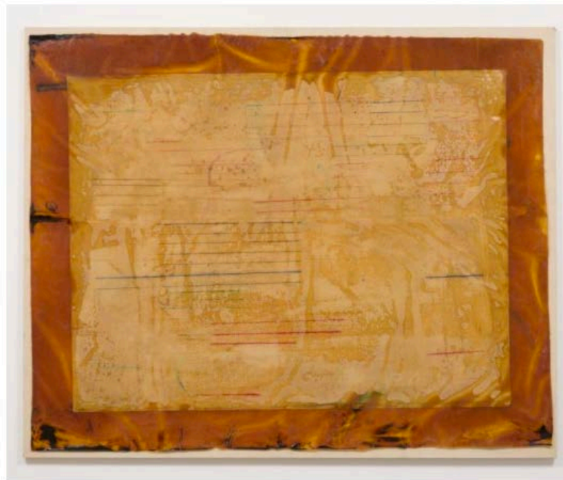
Ed Moses, "Untitled" (c. 1971), resin and powdered pigment on canvas, 96 x 108 inches

For example, in the current exhibition of Moses's work at Albertz Benda , "Double-Trac aka NY Trac" (1974), a forceful diagonal composition, appears to have come from a vastly different place than a later diagonal work, "Green Man" (1989–2004). Even so, the visual impact of each remains similar. The paintings hold forceful, interrelated energies, contained in the way Moses vigorously applies paint and related elements, including graphite, India ink, masking tape, mylar, and polyester resin. "Wall Layuca" (1989) looks like he scumbled together vertical slices of black, white, and ochre in both oil and acrylic pigments. Although the application processes Moses employs are difficult to quantify, he develops his surfaces layer by layer. In an early example, the Hegeman Series (1970–72), the alternating build-up of acrylic and polyester resin with masking tape produces a density of light that's spread evenly across each painting. One of the most striking is "Pulled Wedge 1" (1972), for which the artist chose translucent parchment instead of canvas as his base.