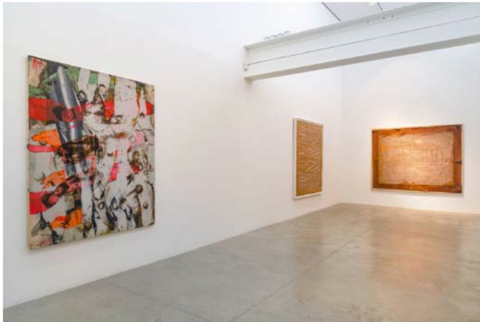
Installation view, 'Ed Moses: Painting as Process' at Albertz Benda (click to enlarge)

This admirable breadth of experimentation is currently on display at Albertz Benda, in what’s being touted as the first comprehensive survey of Moses’s work on the East Coast. Indeed, I was taken by several paintings I had never seen before, including the “Untitled” diagonals from the mid-1970s as well as the heroically poured and squeegeed paintings “Oh Ed #2” and “Montirr Aix” (both 1999). When seen together, these seemingly contrary paintings suggest a rare holistic, earthly fecundity. They don’t disguise the visible influences of earlier artists — ranging from the Paleolithic cave painters, whom Moses often cites, to Malevich and Moholy-Nagy — yet even as one finds such traces, Moses’s canvases are less about the appropriation of style than the endurance of an ongoing dialogue with the material process of painting.