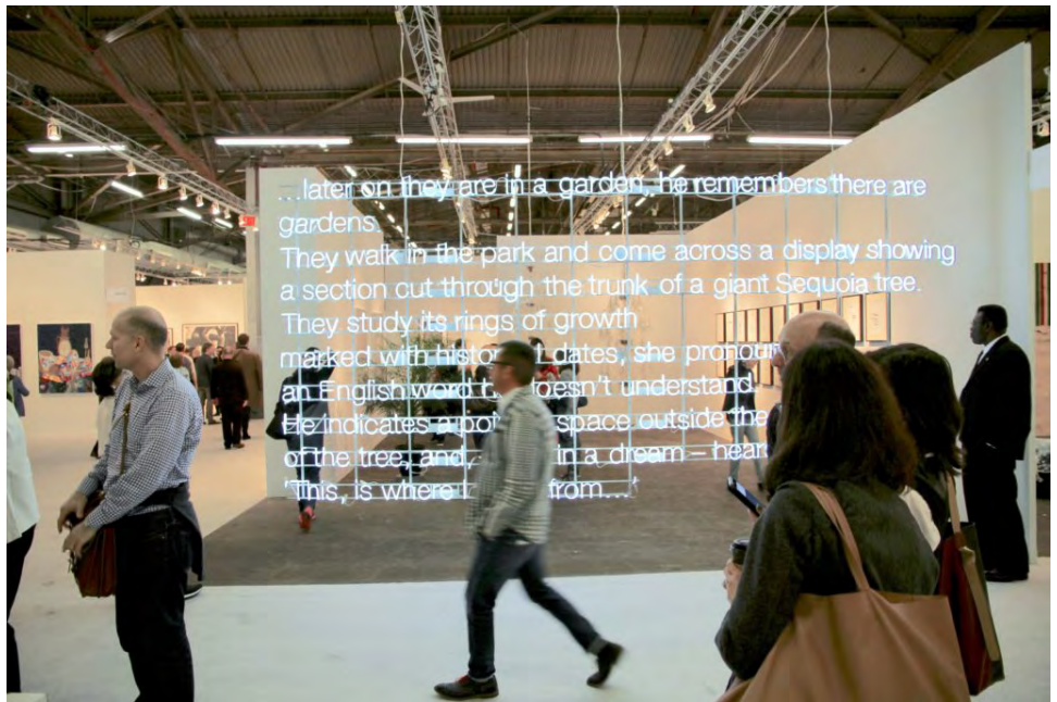
White Cube.

Crowds descended on the midtown piers in the Hudson River yesterday morning for the VIP preview of the latest edition of the Armory Show, and dealers were already reporting brisk sales to artnet News by mid-afternoon. Despite what some observers described as a rather tame showing of art that didn't exactly address the current political backdrop or mood, there was plenty of top-flight blue-chip work on view and buyers were obviously enthusiastic.