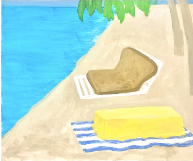
Scott Reeder, Bread & Butter (Tropical Beach), 2020.