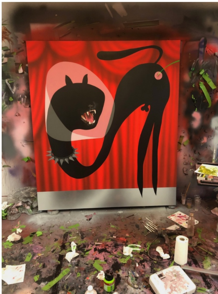
Oli Epp, Spray, 2020.

Laster, Paul. "Highlights from Dallas Art Fair Online." Whitehot Magazine of Contemporary Art , Apr. 2020, whitehotmagazine.com/articles/from-dallas-art-fair-online/4574 .