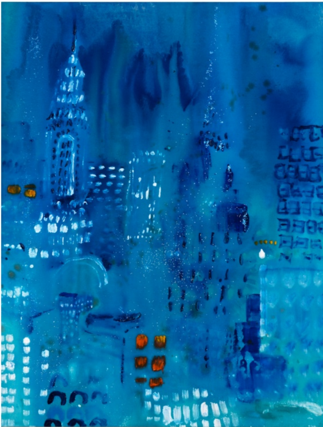
Tabboo!, Rhapsody in Turquoise, 2020. Courtesy Gordon Robichaux

Laster, Paul. "Highlights from Dallas Art Fair Online." Whitehot Magazine of Contemporary Art , Apr. 2020, whitehotmagazine.com/articles/from-dallas-art-fair-online/4574 .