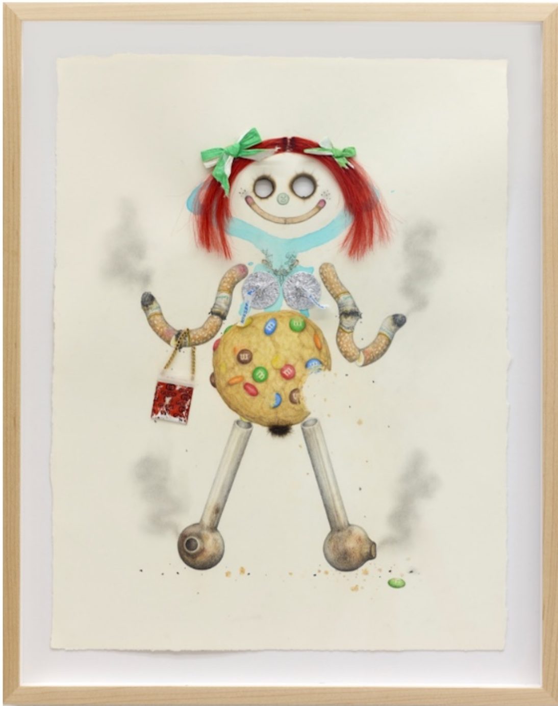
Aurel Schmidt, Cookie, 2020.

Laster, Paul. "Highlights from Dallas Art Fair Online." Whitehot Magazine of Contemporary Art , Apr. 2020, whitehotmagazine.com/articles/from-dallas-art-fair-online/4574 .