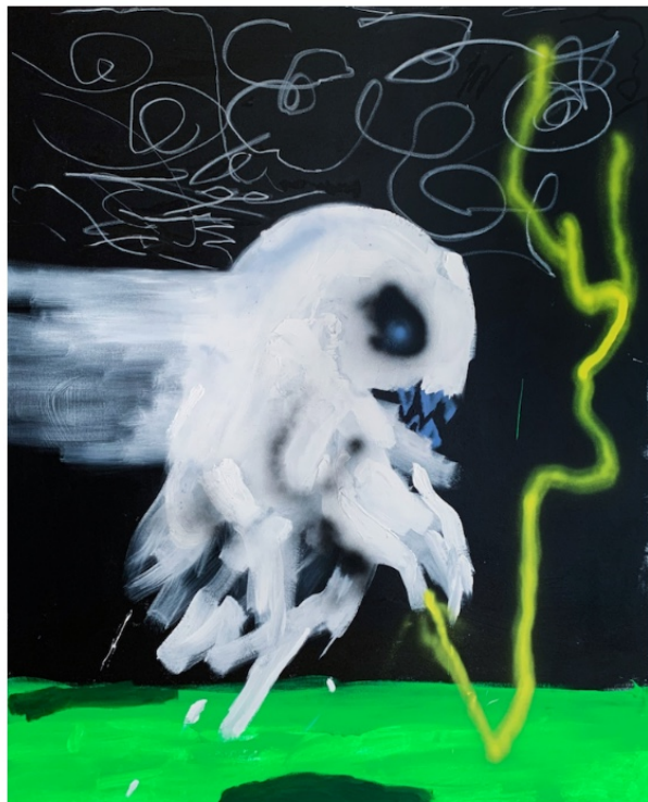
Robert Nava, Grass Ghost , 2020.