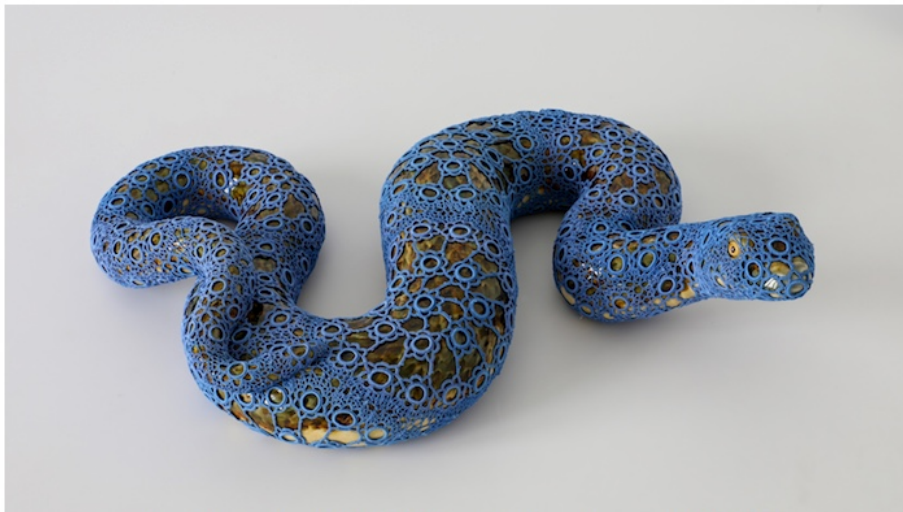
Joana Vasconcelos, Malu, 2018.