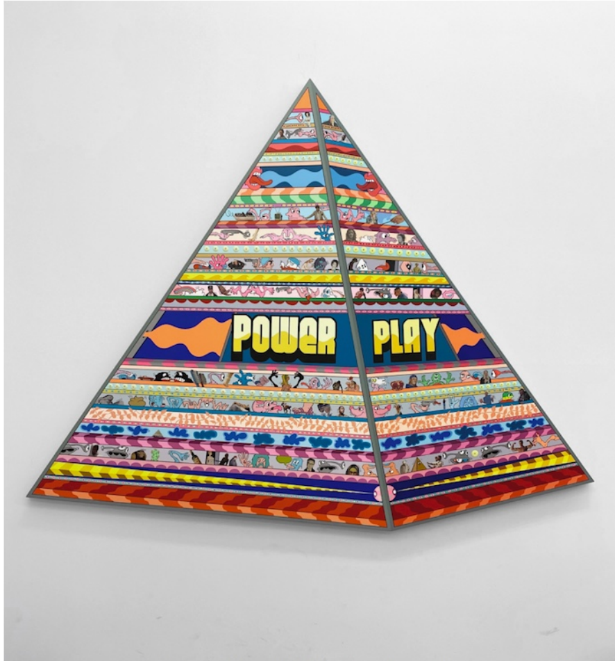
Erik Parker, To be Titled, 2020. Library Street Collective