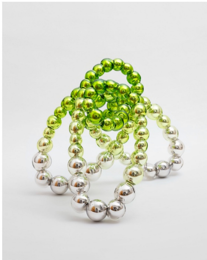
Jean-Michel Othoniel, Kiku - Hiwamoegi (Siskin sprout yellow), 2020, 2020.

Laster, Paul. "Highlights from Dallas Art Fair Online." Whitehot Magazine of Contemporary Art , Apr. 2020, whitehotmagazine.com/articles/from-dallas-art-fair-online/4574 .