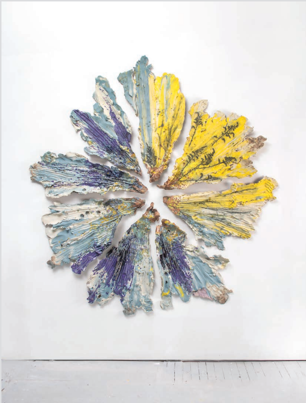
BRIE RUAIS , Spreading out From Center , 132 lbs (Fort Tilden October 2019), 2019, glazed and pigmented stoneware, hardware, 198 × 190.5 × 7.6 cm.