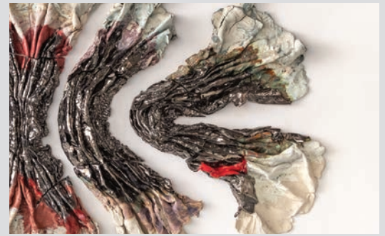
Detail of BRIE RUAIS's Compressing from West and East, five times 135 lbs, 2020, glazed stoneware, hardware, 188 × 325 × 15.25 cm.

The artist deeply engages with the earth both in a material and a symbolical manner. The pigmented clay that Ruais employs recalls color variations of iconic American landscapes, like the red-hued rocks of New Mexico and Utah, and the multi-toned palette of geological formations in Arizona and her native California. She also finds inspiration closer to home: in some of her recent works, Ruais draws