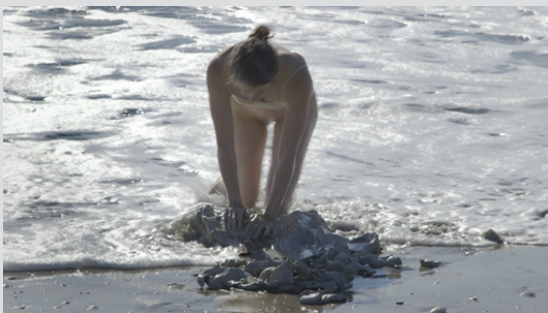
Stills from BRIE RUAIS's Tidal Movement , 2019, three-channel video: 12 min.