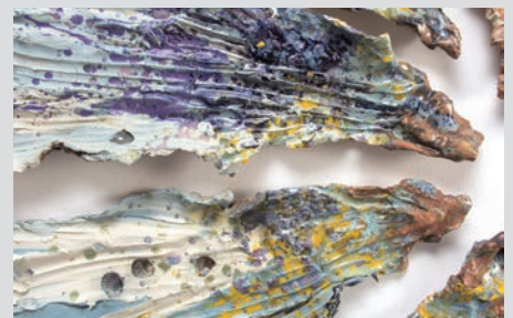
Detail of BRIE RUAIS 's Spreading out From Center , 132 lbs (Fort Tilden October 2019), 2019, glazed and pigmented stoneware, hardware, 198 × 190.5 × 7.6 cm.