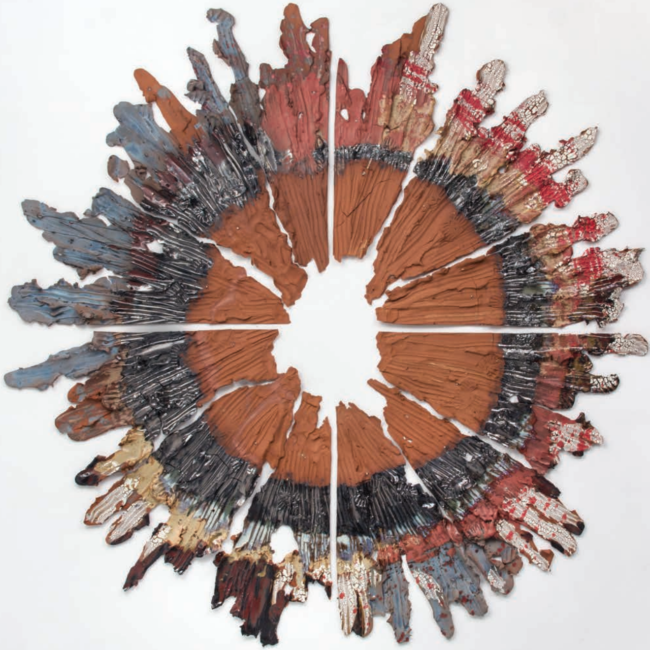
BRIË RUAIS, Closing In On Opening Up, 132lbs (Nevada Site 3) , 2020, glazed stoneware, hardware, 226 × 223.5 × 7.5 cm.