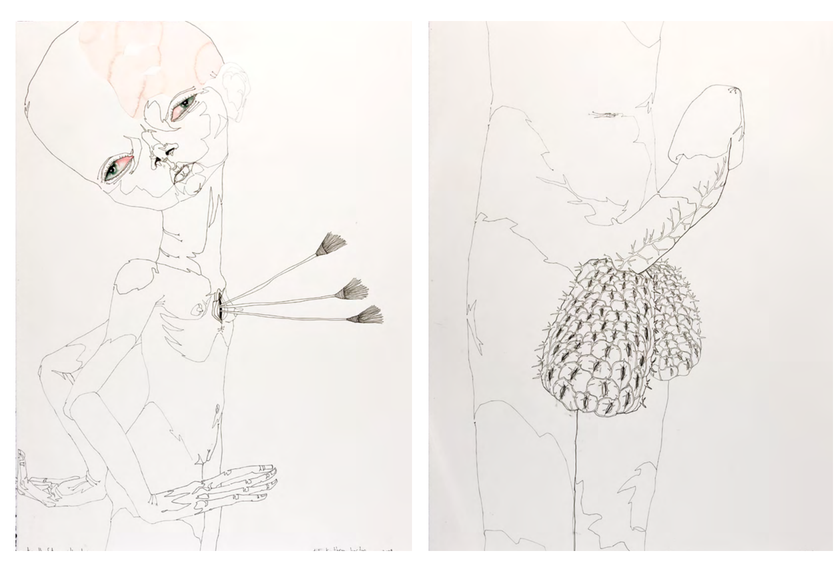
Meeting the Future With Love, left, and My Fruits of Love, right, both 2008. Watercolor, gouache, and ink on hot pressed paper, 32½ x 24½ in. each.

again, but this time in a public furor when conservative corners of the country, and the media, objected to a sexually explicit body of work that was included in the group exhibition "Optimism" at Brisbane's statefunded Gallery of Modern Art. The exhibition's premise was to look at the human ways of expressing "hope, energy, passion, and playfulness." The series, I am flesh again, featured male and female genitalia, as well as other delicately drawn body parts like eyes, hands, and breasts, along with abstract organic shapes, and surprising juxtapositions of all of these forms. It was labeled obscene. "All of a sudden I'd ended up on the front page of the newspaper for X-rated art and was being called 'morally unfit to be a mother," Barton says.