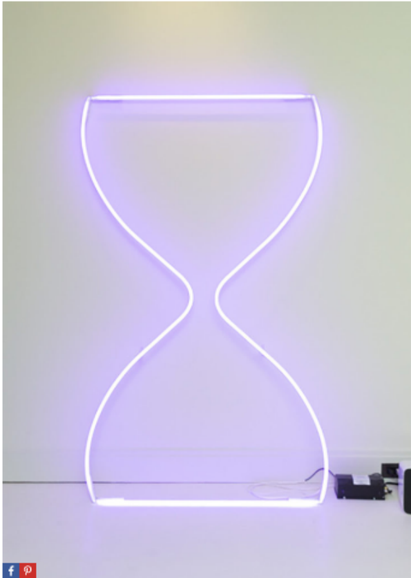
Time's Up , 2017.

AS: Last year you unveiled the mural, We Hold These Truths To Be Self-Evident , exploring the language politicians have used to describe women. Why has it been important for you to explore not just feminism but also how masculinity informs perceptions of femininity?