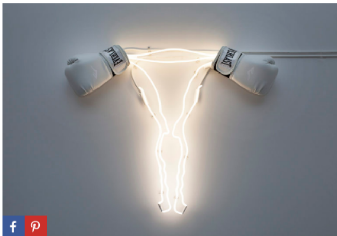
Champ , 2016, from the series "Mostly It's Just Uncomfortable."