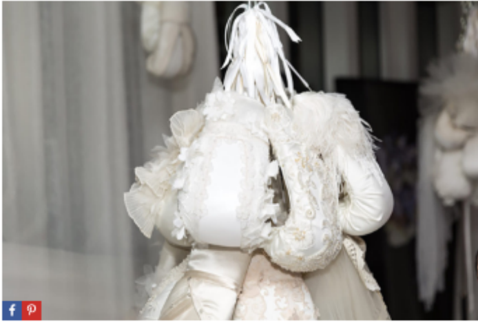
Wakeful Anguish from the series "Let Her Rave," 2017.

know, what is a real woman's life like? Show the difficult challenges that we face like abortion, periods, birth, and show our sexuality and our sexual appetite. All of these things I think have been sort of swept under the carpet in all facets of our society.