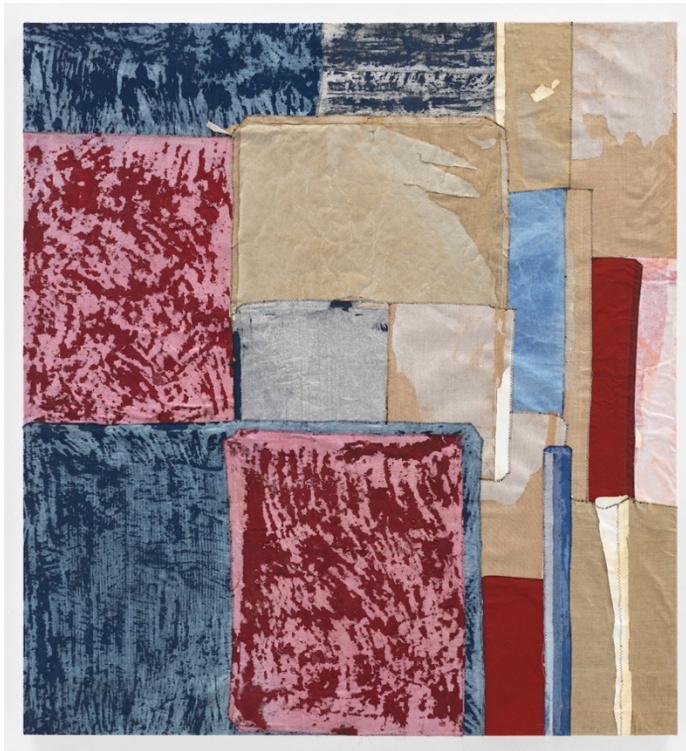
SAMUEL LEVI JONES, INTERCALATE (2018). DECONSTRUCTED PRINT PORTFOLIOS ON CANVAS, 60 X 55 INCHES.