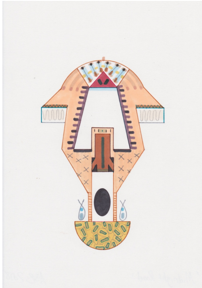
MBA SAYAL-BENNETT, MIDNIGHT ROAD (2018). INK, PRO-MARKER, GRAPHITE ON PAPER.