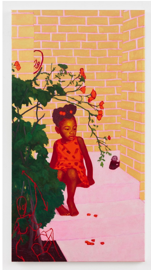
ARCMANORO NILES, WHEN YOU GIVE YOUR LOVE AWAY (2018). OIL, ACRYLIC AND GLITTER ON CANVAS, 68 X 36 INCHES.