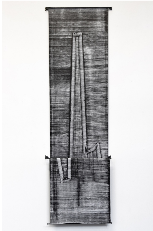
AMELIE BOUVIER, MOVEMENTS AND DISRUPTIONS #3 (2017). INDIAN INK ON CANVAS AND METAL 86 3/6 X 20 1/2 INCHES.