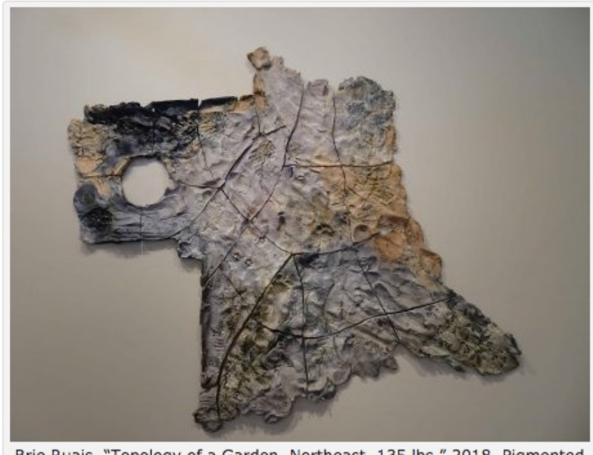
Brie Ruais, "Topology of a Garden, Northeast, 135 lbs," 2018. Pigmented clay, acrylic paint, and hardware.